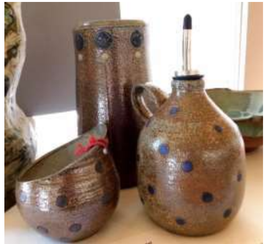
Three Piece Kitchen Set Soda Fired Ceramic by Nicole Copel