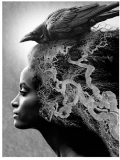
2022 Photography Show