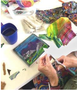
Marika Guthrie's Landscapes with Fabric